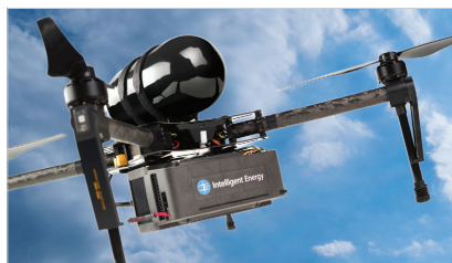
ABOVE: PHOTO COURTESY OF INTELLIGENT ENERGY